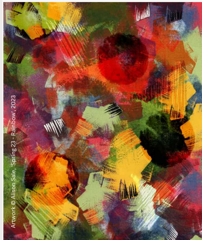
Artwork © Alison Sale, 'Spring 23 - Rainbow', 2023