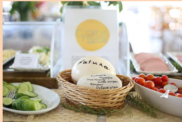
Natura Hotel: Cyprus Breakfast is explicitly branded at the hotel buffet through the logo