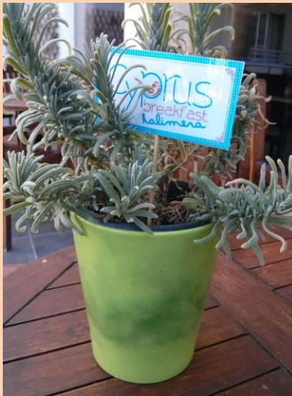
Capital Coast Hotel: Local herbs for a Cyprus Breakfast welcome